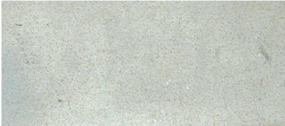
Figure 1: Normal appearance of galvannealed steel sheet

Normally, galvannealed steel sheet has a very uniform matte-grey appearance, as is shown in Figure 1.