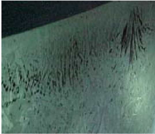
Figure 1 Fretting near coil edge

Figures 1 and 2 illustrate the appearance of fretting on galvanized surfaces. In this case the marks are near the edge of the sheet and were reported to have mirror images on the opposite surface. vii Figure 2 is a close-up of the mark on the right hand side of Figure 1.