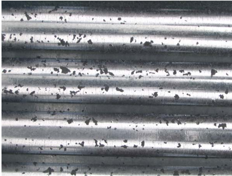
Figure 5 Transit Abrasion (fretting) on corrugated galvanized sheet

Figure 5 is fretting on corrugated galvanized sheet that was observed after transport to a jobsite from a roll-forming mill.