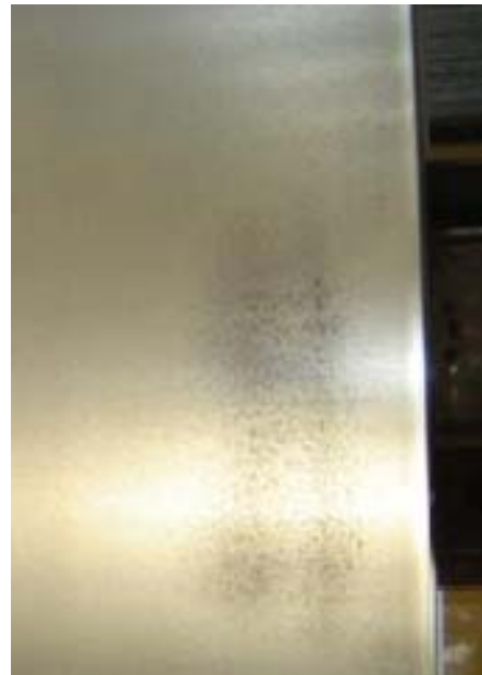
Figure 4 Fretting in area of contact