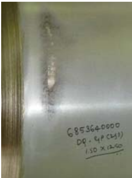
Figure 3 Fretting in area of contact

Another observation made about the nature of these marks, in the case of coil-form material shown in Figures 3 and 4, is that they are located exclusively in the area of contact of the saddle support that cradled the coil(s). The coils had been shipped with their eyes horizontal and aligned perpendicular to the direction of movement.