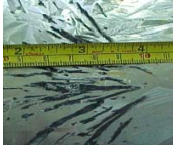
Figure 2 Close-up of right side of Figure 1

(Courtesy of Shantanu Chakraborty/Rajib Chatterjee – TATA STEEL - India)